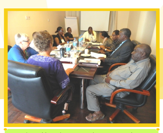
Local hosting committee at work